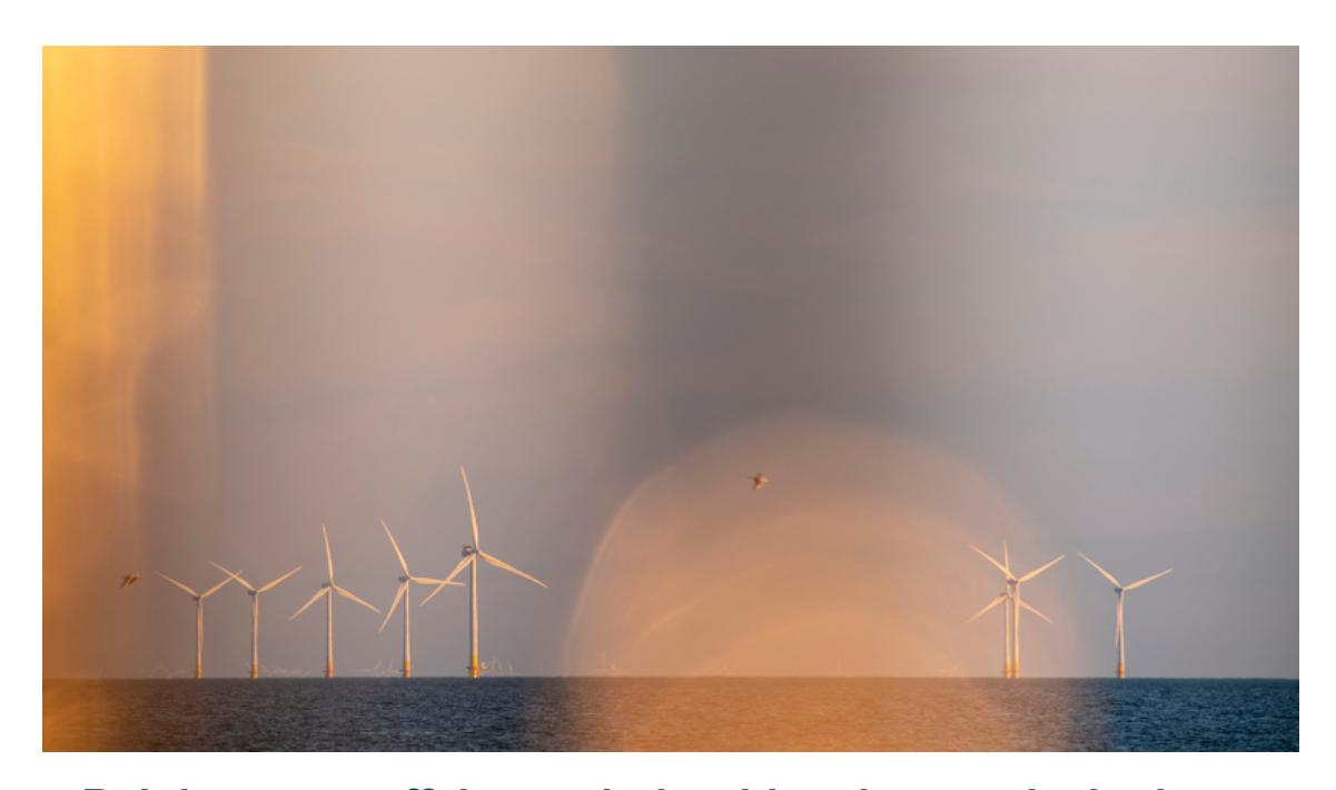
Belgium puts offshore wind turbine decommissioning high on the agenda