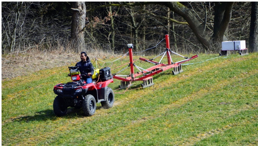
The tTEM system in action.

Farmers and land managers are required to investigate potential pollution sources and pathways and to take preventative action. In the TOPSOIL pilot, a regional cross-catchment steering group including all relevant stakeholders raised awareness of the FRW by launching an information pack for farmers and their advisers at four events across the region.