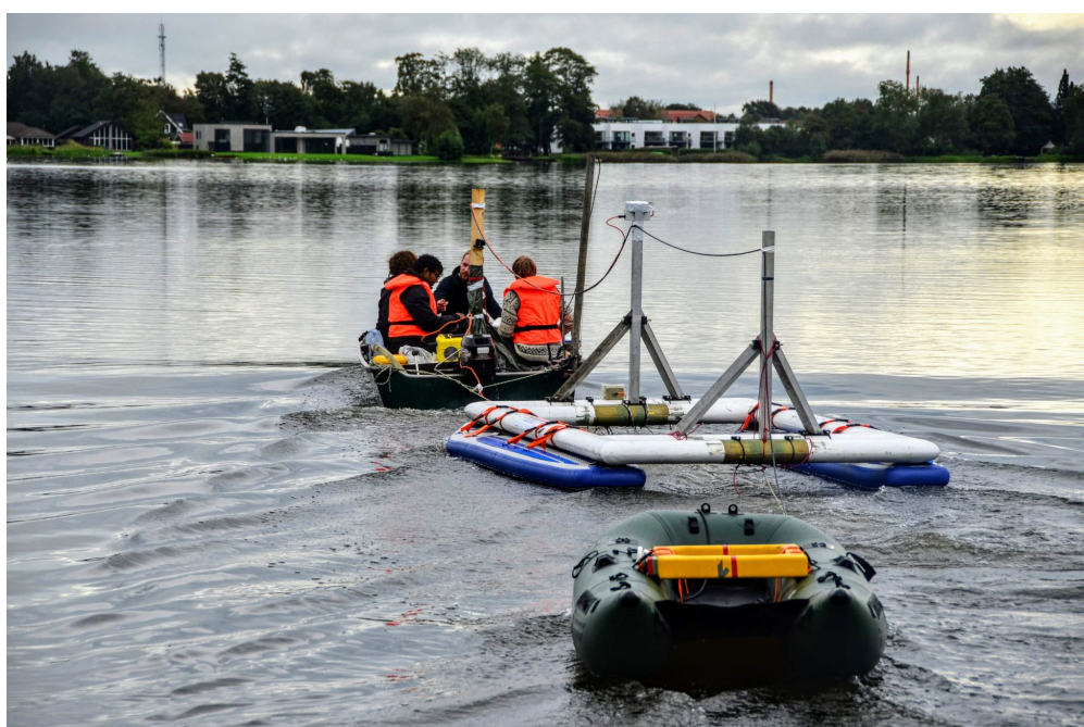
The FloaTEM system. The transmitter coil is mounted on two SUP-boards and the receiver coil is

In this article, we present two examples of project-interventions, which illustrate the complexity of climate adaptation in groundwater management: An innovative geophysical method to generating crucial data and a cooperative approach involving farmers in groundwater protection.