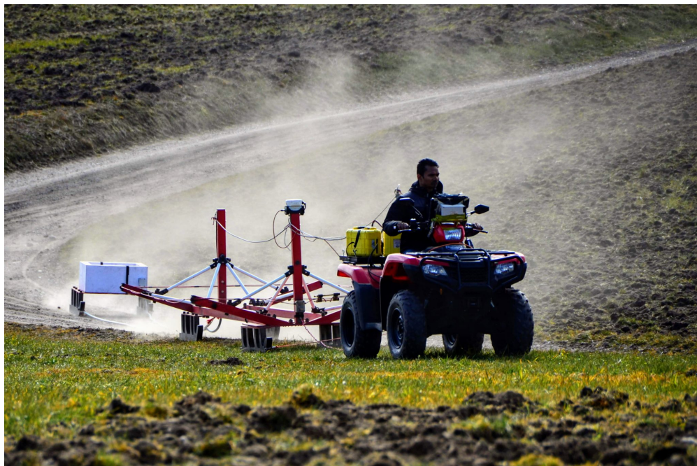
The tTEM system in action.