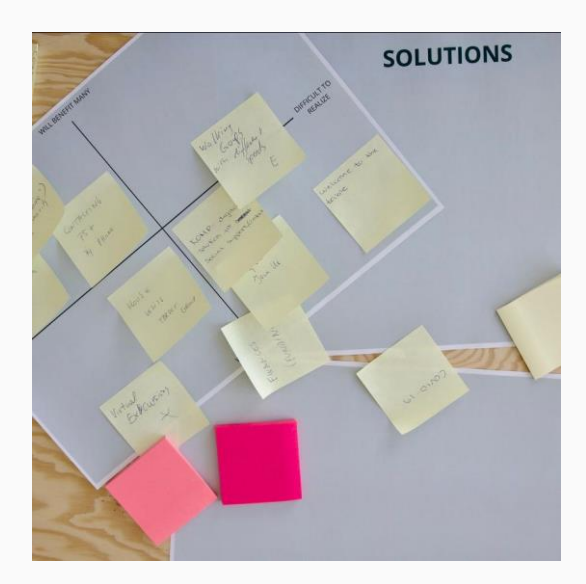
Workshopping solutions >